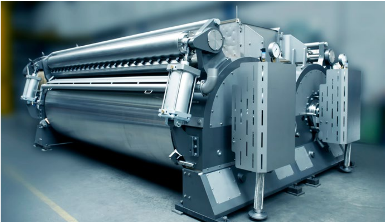
ANDRITZ Gouda double drum dryer